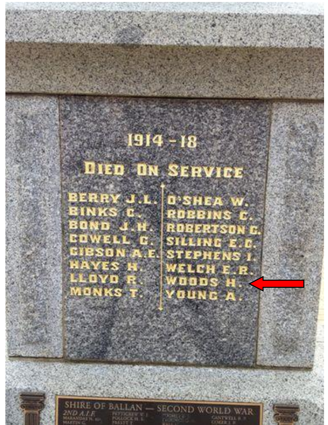
Ballan War Memorial