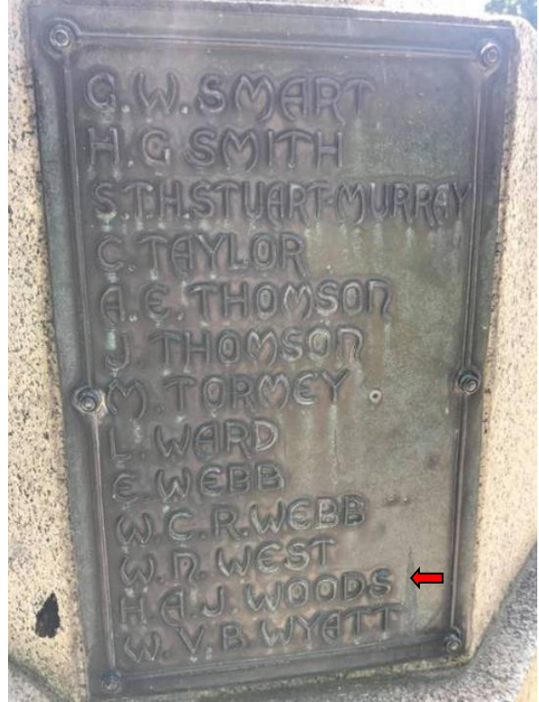
Surrey Gardens Memorial Cross