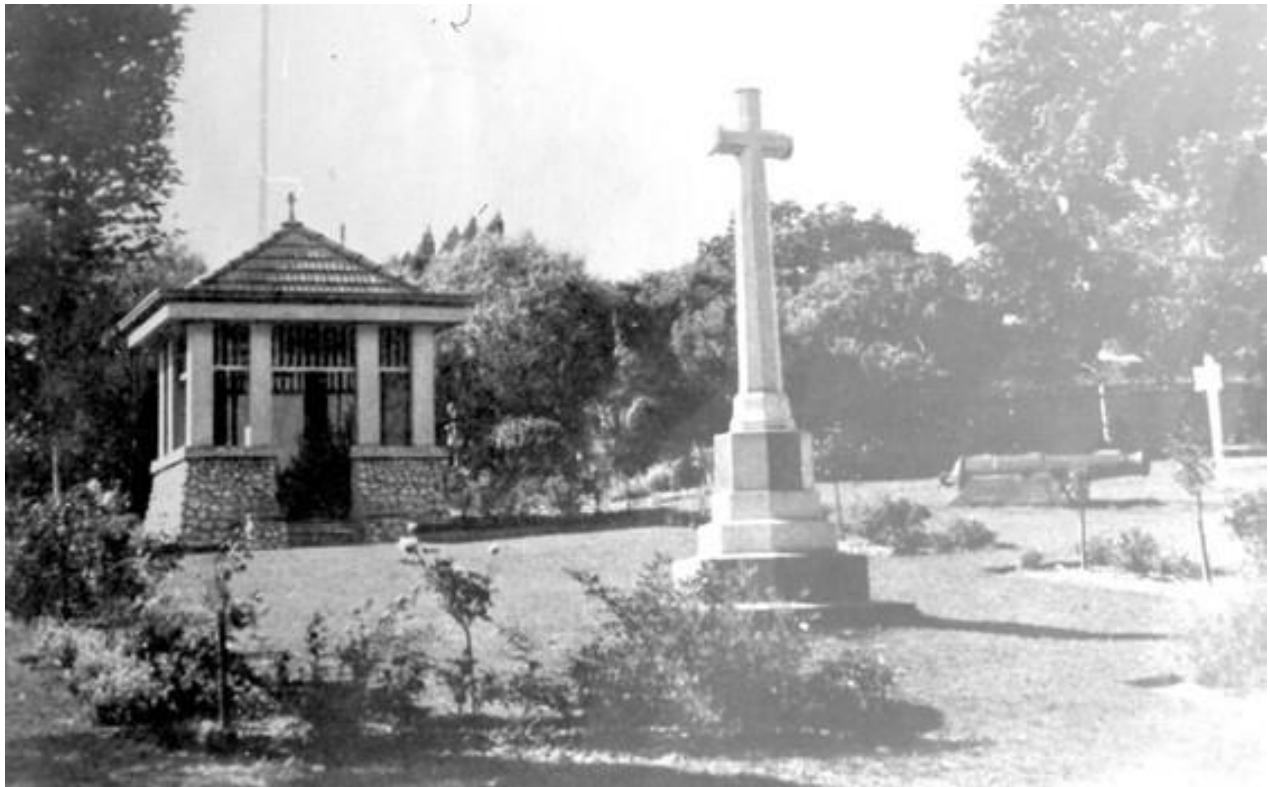
The Shrine (background) & Memorial Cross in Surrey Gardens (1933)